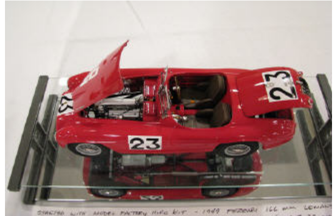
A very nice 1/24th scale Ferrari 166MM.