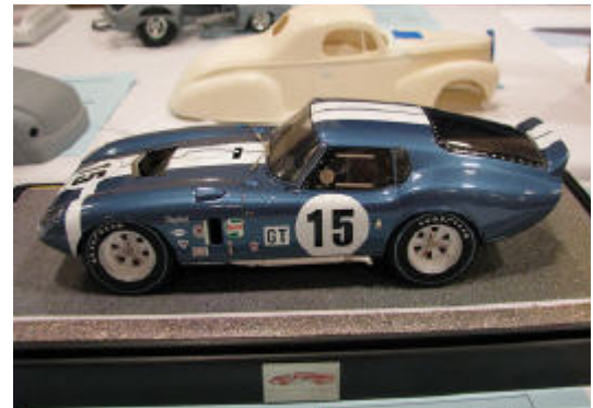
1/24th scale Cobra Daytona Coupe from Scale Motorsports multimedia kit