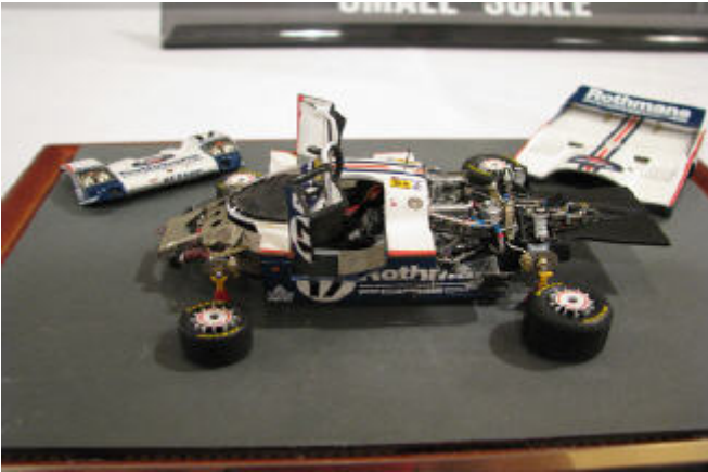
Hard to believe this is a 1/43rd scale model!