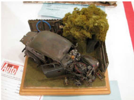
Another diorama sporting a very well executed weathering finish.

A really nice HO Scale diorama of the legendary barn find that every car guy dreams of.