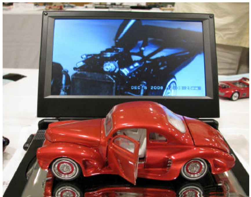
A 1/25th scale custom featuring opening doors, trunk, hood, poseable and working suspension. Oh yeah, a DVD of the construction and how things work. Gentlemen, start your popcorn!