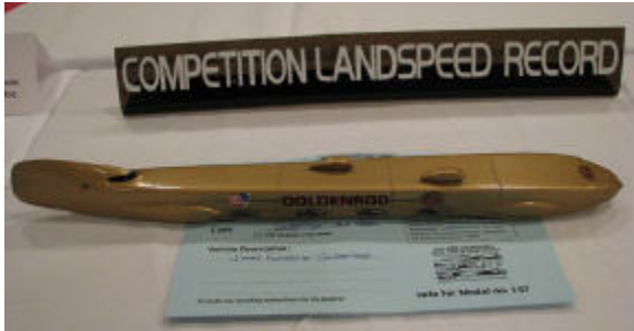
Goldenrod. Salt Flats record holder