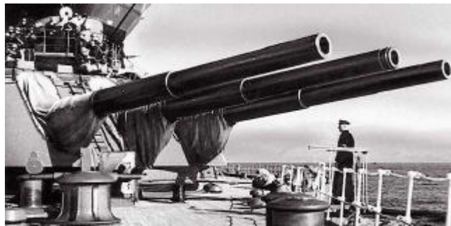
12" guns on an unidentified Russian battleship

Admiral Souchon who was a descendant from French Huguenots who left France during the 16 th century religious wars. The Russian were led by Admiral Andrei Eberhardt the descendant of a Swedish officer who had been captured by the Russian and offered his service to Peter the Great. The result of the battle was that the German never again faced the combined Russian Black Sea Fleet and the Russian fast light cruisers of the Novik class were able to attack the Turkish coast at will, disrupting their communications as the railroad lines were usually laid very close to the coast line.