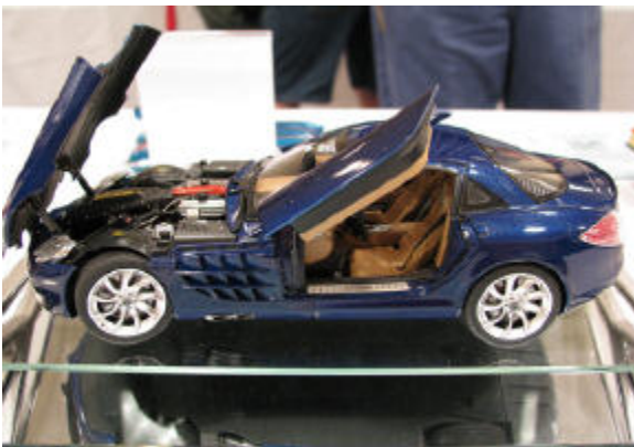
1/24th scale Tamiya McLaren Mercedes SLR featuring some photoetch detail from KA Models.