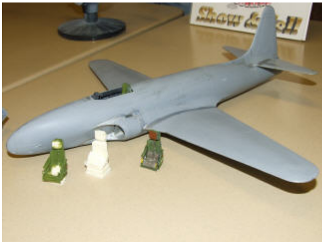
Bill Speece- Czech Model 1/32 nd Scale P-80