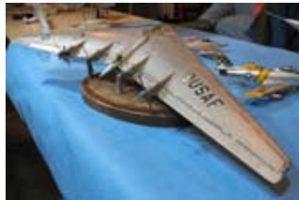
Theme Build Natural Finish