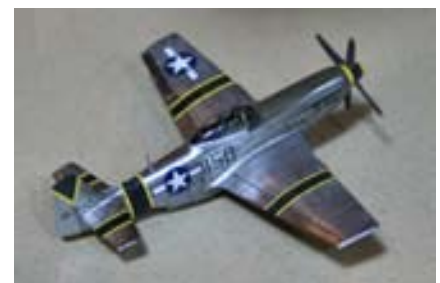
Platz P-51D 1/144th Scale by Darrin Bringman