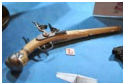
Life-Like Dutch Flintlock 1/1 Scale by Bill Speece