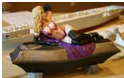
The Countess 1/9th Scale by John Thirion