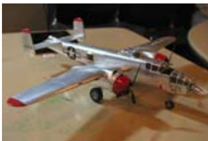
Monogram B-25 1/48th Scale by Sam Heesch