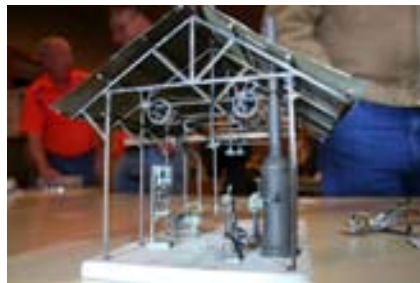
Scratchbuilt Open Air Engine Shed 1/48th Scale by Gil Flores