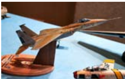
Hasegawa F-15 A "Streak Eagle" 1/72nd Scale by Jim Burton