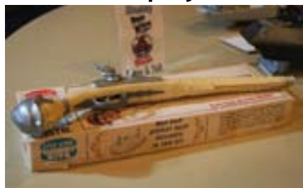
Life-Like Dutch Flintlock 1/1 Scale by Bill Speece