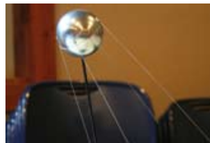
Scratchbuilt Sputnik (Sort of) 1/10th Scale by Randy Hall