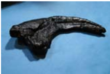
Scientific Models Velociraptor Claw 1/1 Scale by Bill Speece