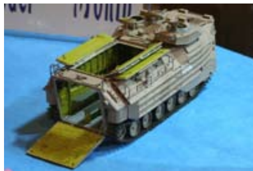
Academy AAVP-7A1 1/35th Scale by Jim Burton