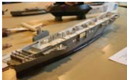
Trumpeter USS Enterprise 1/350th Scale by Jeff D'Andrea