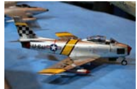
Academy F-86F-30 Sabre 1/48th Scale by Jim Burton