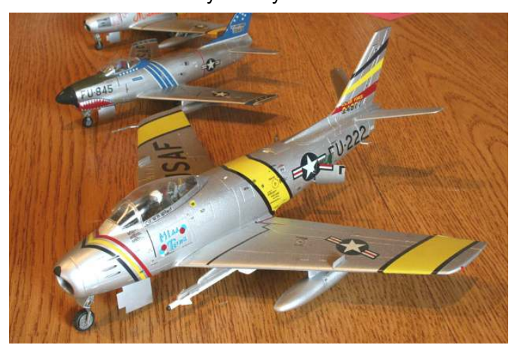
2<sup>nd</sup> Place 1/48 Academy F-86 Sabre by Sam Heesch