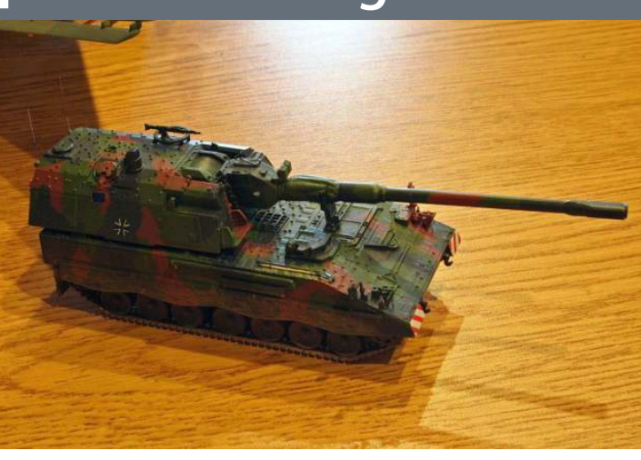
1/72 Revell Panzerhaubitze 2000 by Tom Gloeckle