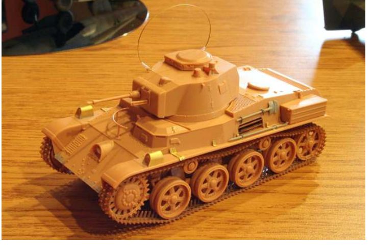
1/35 Hobby Boss 38M Toldi I in progress by Brian Geiger