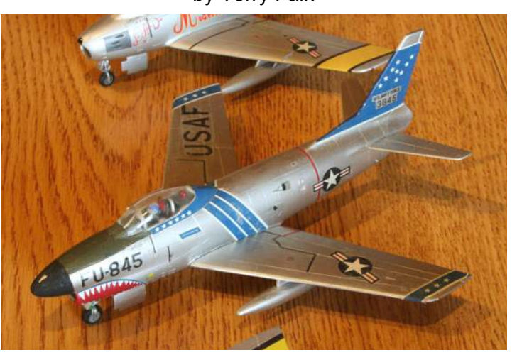
3<sup>rd</sup> Place 1/72 Airfix F-86D Sabre Dog by Terry Falk