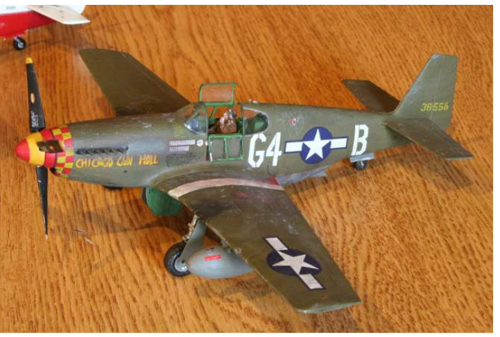
1/48 Accurate Miniatures P-51 by Terry Falk