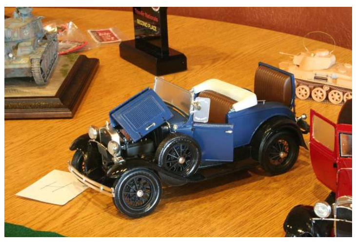
1/16 '31 Ford Coupe by Jim Burton