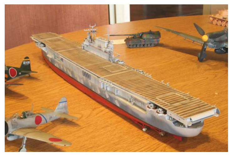
1/72 Hasegawa F-100D by Konstantine Rickford