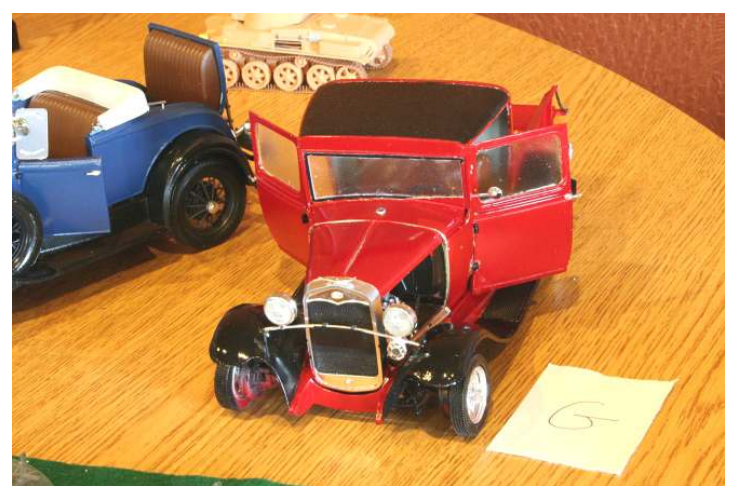
1/16 '31 Ford Pickup by Jim Burton